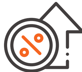
Better Salvage Rates