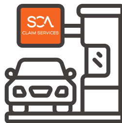
Local SCA Drive-Thru Center