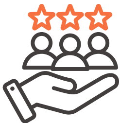
Specially Trained Team

We’re working smarter to deliver the nation’s premier hail claims management solution, and we look forward to partnering with you!