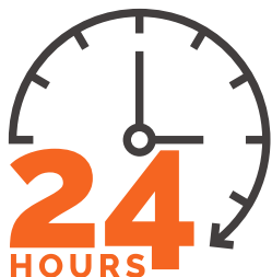
Onsite within 24 hours